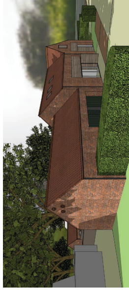
05. Site Perspective Looking North