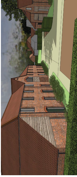
03. Site Perspective Looking South