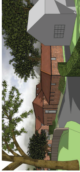
04. Street View Looking East from Back Lane