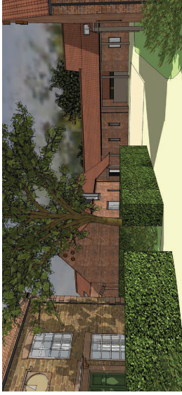
02. Street View Looking South East