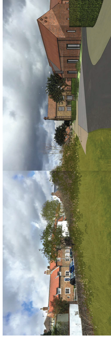
06. Street View Looking East to Old Hall from Butts