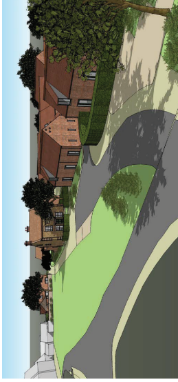
01. Site Perspective Looking East to Old Hall from Butts Lane